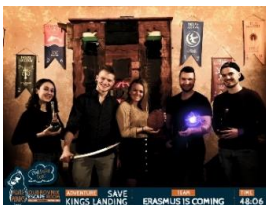
Caption 20 - Escape Room photo

The next activity is more for rainy days, it is the “Puzzle Punks - Dubrovnik Escape Room”, located in Lapad. The experience is available in English. I recommend the Game of Thrones room as the city is famous for it, even if you are not a fan.