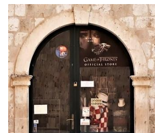
Caption 5 - Game of Throne store

Recently, the city knew a larger success after becoming an open-air studio for some famous movies and series such as Game of Thrones, Star Wars or the new Robin Hood. The tourism increased so much after their success that some touristic activities or shops have emerged with Game of Throne as main theme.