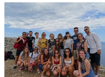
Caption 30 - On top of Lopud

Another excursion I did was Lopud Island which is one hour away by boat from Dubrovnik. It is known for its sand beaches because in Dubrovnik beaches are rocky. It is a good excursion to do to on a free sunny day. We went at the top of the island to admire the view and also took a mini car to cross the island from one side to another.