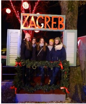
Caption 27 - Christmas market

I visited the capital, Zagreb, in winter, with an organized trip by the ESN group. We first stopped at the most famous national park in Croatia, Plitvice Lakes National Park. As it was winter there was not so many people which was enjoyable. We then spent our time in Zagreb where the Christmas season was just beginning so it was even more delightful to me. The capital is very different from the coastal cities yet it was nice to discover it.