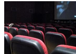
Caption 21 - Kinematografi Dubrovnik

Another activity that I recommend is to go the cinema watch a movie. Indeed, as students from the University of Dubrovnik, the cinema is free for us so it was a nice activity to do in winter every now and then.