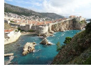
Caption 13 - View from the fort

Next to the Old Town is the Fort Lovrijenac which is quick to visit but gives a beautiful view over the Old Town and the Adriatic Sea.