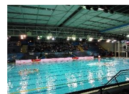
Caption 23 - Water polo match

The last activity I did that I recommend is to go see a water polo match of the local team which is very famous. Even though you are not a fan of this sport it is interesting to discover the local sport.