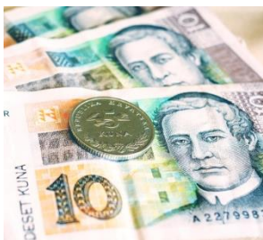
Caption 2 - Croatian currency

The Croatian population is a little higher than 4 million. The official language is Croatian but most people know how to speak English (minimum level). The national currency is the Croatian Kuna (HRK), approximately 1€ equals 7,5 HRK (by choosing this destination you will work on your table of 7!).