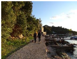
Caption 16 - The pathway

I also enjoyed to walk by the sea in Babin Kuk area, the pathway is called "Ulica Ivana pl. Zajca", it is peaceful and awesome to be able to walk everyday over there by the crystal-clear sea and rest on one of the numerous beaches.