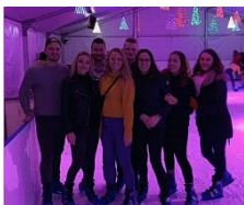
Caption 22- Ice skating photo

The next activity will be available only in the winter period as it is the skating-rink in Lapad. It is very small but it guarantees you a fun couple of hours with your friends.