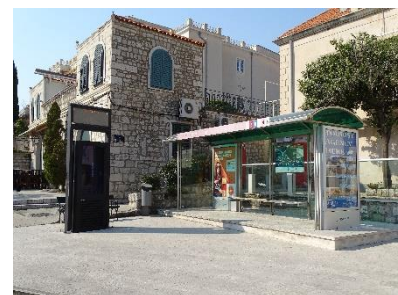
Caption 7 - Pile Gate bus stop

Dubrovnik is a small city so you can walk easily to go from one part of the city to the other. However, as there are a lot of stairs you will find the bus quite pleasant and useful. At the beginning of the year, the university took care of our bus card and create it for us. We just had to pick it up at one bus office “Libertas Dubrovnik” and pay for it plus the first month payment. Because we are student at the University of Dubrovnik, we only pay 50kn per month, which is quite cheap. This is the main transport students use.