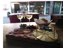
Caption 10 - Kuća Pršuta