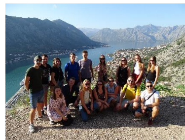
Caption 24 - Kotor

One of the most memorable weekends for me this year was my trip to Kotor in Montenegro with my German and Polish friends. We went there mid-October by bus and for two days. Kotor is a very small city so it is quick to visit. We visited the Old Town the first day and climb up the city walls and met other Erasmus students.