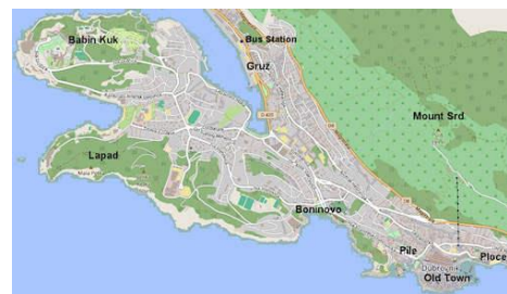
Caption 4 - Map of Dubrovnik

Dubrovnik, where I studied this year, is one of the most touristic cities of Croatia. Its nickname is "The Pearl of the Adriatic". It is a small city of around 50,000 inhabitants located at the very south of the country and is part of the Dubrovnik-Neretva county. Dubrovnik is a city with a unique political and cultural history and is world famous for its heritage and beauty.