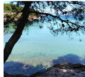
Caption 28 - Beach near Jelsa

The last trip I was able to do was in Croatia in the city of Zadar and Hvar island. I travelled along with another French Erasmus friend this time and we rented a car for 3 days. Zadar is quick to visit but I really enjoyed its famous “Sea organ” that create music sounds according to the waves. As for Hvar Island I recommend the car if wanting to visit the whole island but if not just taking a ferry and stay in one city is perfect. I would describe Hvar island as paradisiacal!