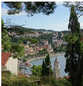
Caption 29 - Cavtat

Moreover, I had the opportunity to explore areas close to Dubrovnik on one day excursion trips. The first one was organized by the ESN team, it was an excursion to the city of Cavtat and not so far away from it, Sokol Tower with an amazing view at the top. It is always nice to participate to the excursions the ESN organizes and often it is very cheap or even free!