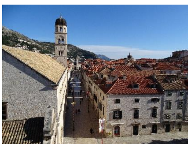
Caption 12 - Stradun Street

Dubrovnik is a beautiful city with many places to discover and landscapes to admire. In this part I will present my favorite spots from the city that in my opinion are a must-see when visiting the city.