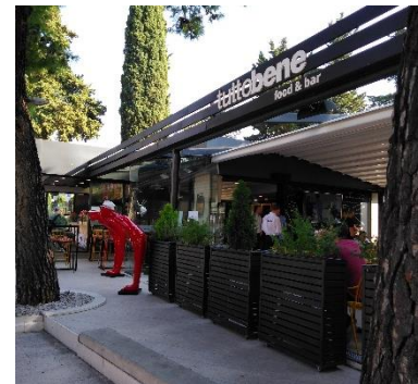
Caption 8 - Tutto Bene restaurant

The student “menza”, the university restaurant, was not available because of bankruptcy. So exceptionally this year, the student restaurant was for us the restaurant Tutto Bene, located near the Economic Department. The university negotiated with them some student prices so a meal was only 7kn for us, 1 euro. We were able to have lunch and dinner there at given hours. In comparison with France, the prices are really low for a meal so it was interesting to reduce the expenses on that side.