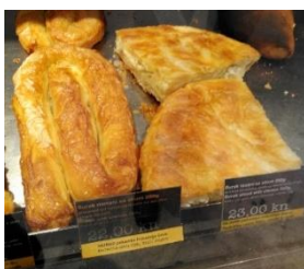
Caption 9 - Burek in a bakery

However, if the dormitory opens next year, a student restaurant is also supposed to open.