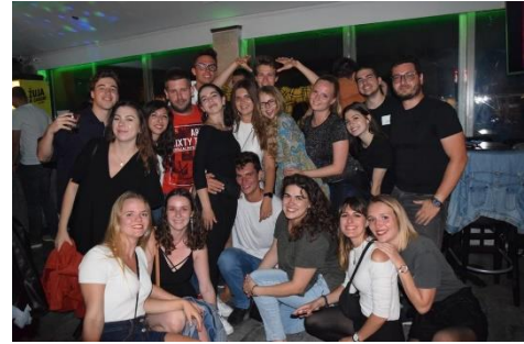
Caption 11 - Goodbye party at Time Out

One of the main places Erasmus students get together is the Time Out bar, located near Lapad area. The ESN organization has a partnership with the bar so we often have private parties with discount there. It is a great bar because we can just hang out playing pool, darts or table football, but also have karaoke nights or dance along the music until late.