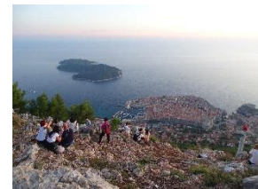
Caption 15 - Mount Srđ's view

This time it is more a view to admire, the breathtaking view from Mount Srđ, the highest point of the city. It is possible to go there hiking, by car or by using a short cable car. From there you can have a drink or just admire the view of Dubrovnik.