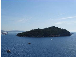
Caption 14 - Lokrum Island

A day trip I loved to do was to the island of Lokrum which is only 10min away by boat from the Old Town's port. The island is rich with fauna and flora and swimming there is fantastic. It is also possible to hike at the top of the island and visit the small museum and learn about its legends.