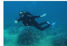
Caption 19 - Diving photo

Another water activity I loved to do is diving. With two Erasmus friend we chose the organization Blue Planet to do our first diving and it was amazing. The monitor spoke well English so it was perfect.