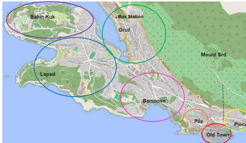
Caption 6 - Areas of Dubrovnik

Now let's discover different areas of the city.