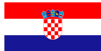
Caption 3 - Flag of Croatia

The flag of Croatia features red, white and blue stripes and a coat of arms in the center. The 5 small shields on top of the main shield represent the five historical regions of Croatia and then there is the “šahovnica” which is the red and white chessboard.