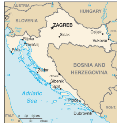
Caption 1 - Map of Croatia

Croatia, Hrvatska in Croatian, is located in the southeast and central Europe by the Adriatic Sea and is part of the Balkans. It has borders with 5 countries: Hungary, Slovenia, Serbia, Bosnia-Herzegovina and Montenegro. Croatia, which seems to have a dragon shaped, is divided in 20 counties such as Istria, Split-Dalmatia or Dubrovnik-Neretva and one city-county, Zagreb, which is the capital of Croatia. The country is in the same time zone as France.