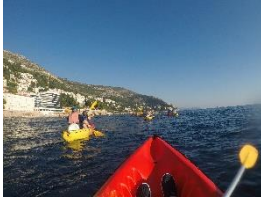
Caption 18 - Kayak tour

The first activity I would recommend is kayaking. A lot of kayak tours exist during the summer season and it was really fun for me to do. I chose a sunset tour (via TripAdvisor) with a couple of friends to watch the sunset from the kayak and we were very satisfied.