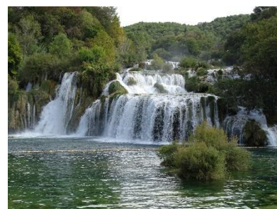
Caption 26 - Krka national park

And of course, I tried to discover every bit of Croatia I could outside Dubrovnik. I first visited Split, Trogir and Krka National Park with my family just before the beginning of the semester. Both cities are very interesting to learn more about the culture and the national park is just beautiful. It was a perfect way to discover the country!