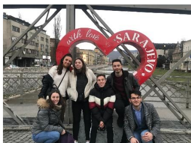
Caption 25 – Sarajevo

The currency of Montenegro is euro so save some if you plan on going there! Kotor is just about 2 hours away from Dubrovnik by bus.